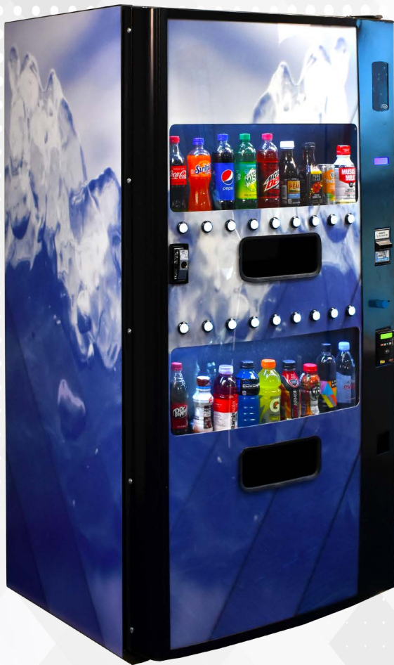
Cassette Style Refrigeration Deck

For the first time, vend almost any product... Square Bottles • Slim Cans • Glass Bottles • Much More!