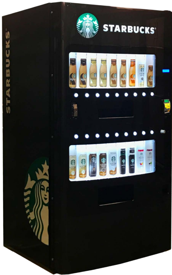
Cassette Style Refrigeration Deck

For the first time, vend almost any product... Square Bottles • Slim Cans • Glass Bottles • Much More!